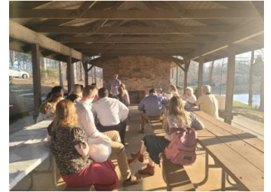
MGMI Annual Staff Conference in South Carolina