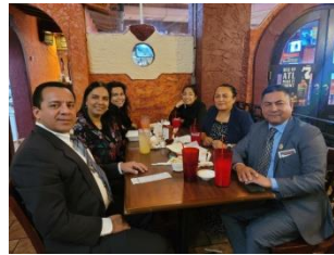
Missionary family at church