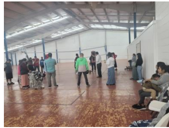
Family fellowship at church